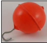
Ball and hook