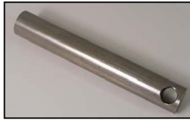
Stainless steel weight