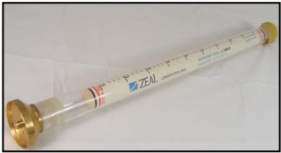
Stem and brass weight